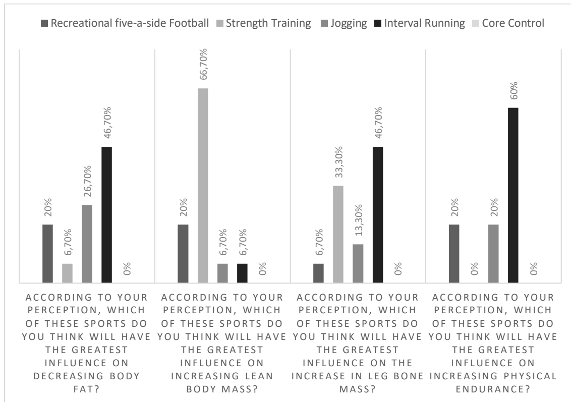
Figure 3. Comparison participant answers.

In the last question, it was asked "according to your perception, which of these sports do you think will have the greatest influence on the increase in physical endurance" and the response rates were: 60% for "Interval Running", while "Jogging" and "Recreational football" both have had 20% of the answers. "Strength training" and "Core control" were not selected, (Figure 3).