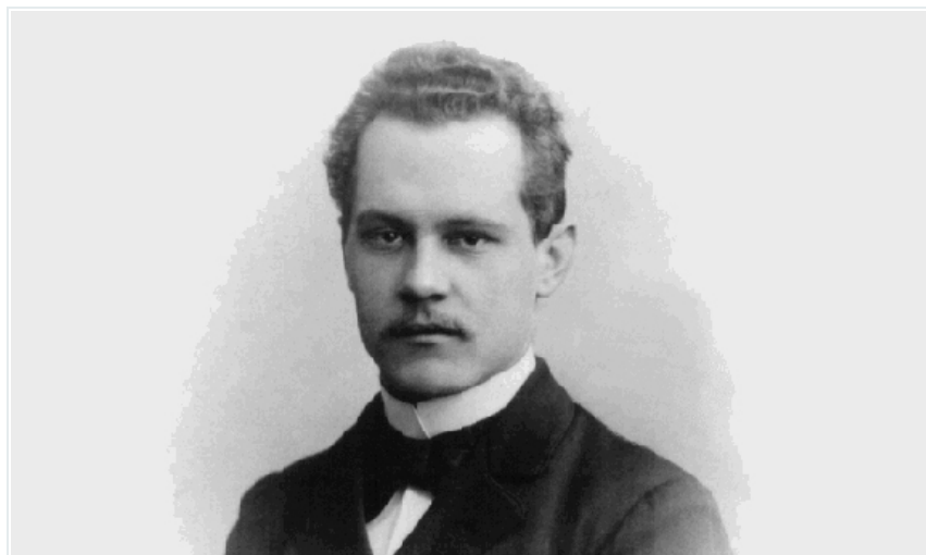
Arnold Johannes Wilhelm Sommerfeld

The theoretical physicist Arnold Sommerfeld (1868-1951) was born in Königsberg, a city in what was formerly East Prussia, today Kaliningrad in Russia, and also the birthplace of the mathematicians Christian Goldbach and David Hilbert , the philosopher Immanuel Kant and the writer E. T. A. Hoffmann . After receiving his doctorate from the University of Königsberg in 1891, he moved to the University of Göttingen, the mecca of mathematics in Germany at that time, where he eventually became assistant to the mathematician Felix Klein and gave classes on mathematics and theoretical physics. After spending some years at RWTH Aachen University, in 1906 he succeeded Ludwig Boltzmann as professor of theoretical physics and director of the Institute of Theoretical Physics at the University of Munich, where he set up a school of theoretical physics which gained worldwide renown.