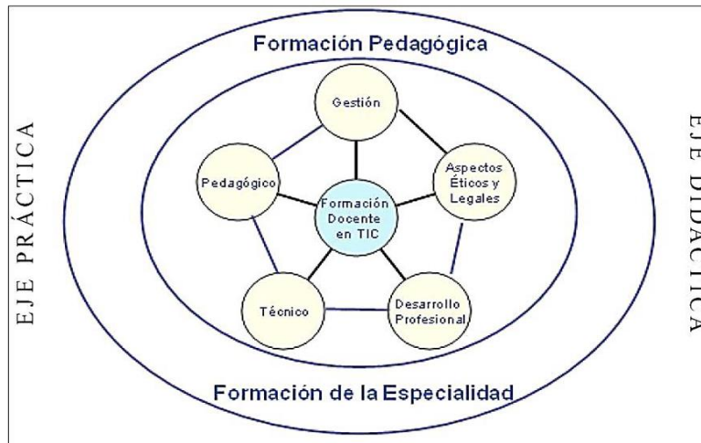
Figure 1. Teacher training digital competence dimensions graph