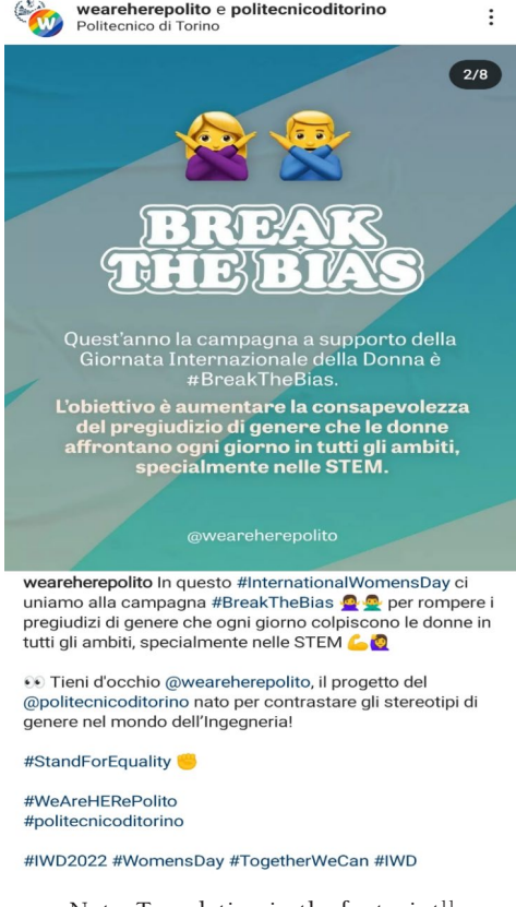
Figure 13. Picture posted by WeAreHERe's Instagram page on 08/03/2022

Note: Translation in the footprint<sup>11</sup>