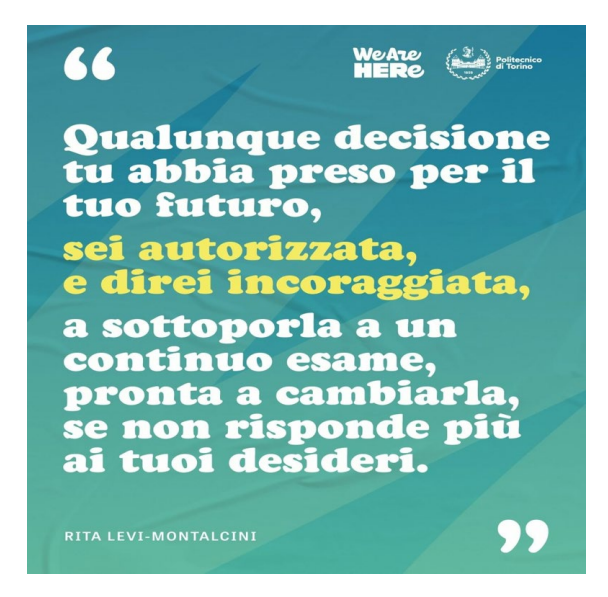
Figure 6. Quote by Rita Levi Montalcini, posted by the Instagram page of WeAreHERe on 04/01/2022

Furthermore, the inspirational quotes intend to reassure to the intended audience that it is expected to experience uncertainty when considering academic or work-related prospects and that setbacks and changes in direction are acceptable, as shown in Figure 6.