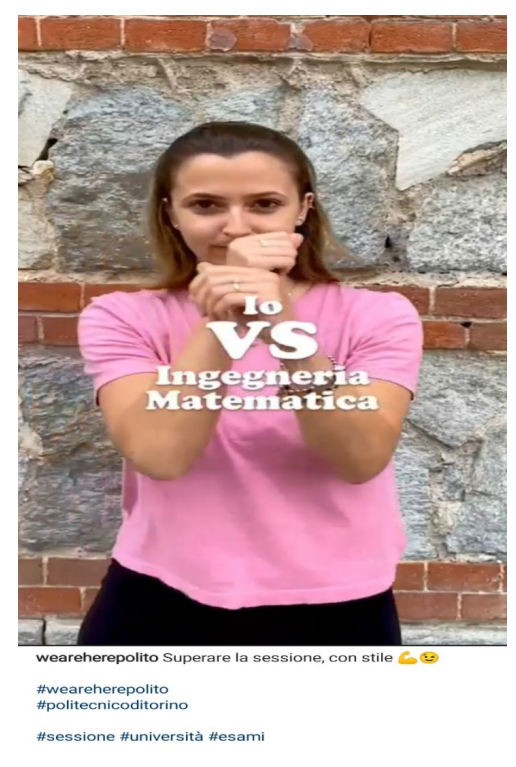
Figure 7. Thumbnail for a meme video posted by the WeAreHERe's Instagram page on 05/07/2022

Note: Translation in the footprint<sup>5</sup>