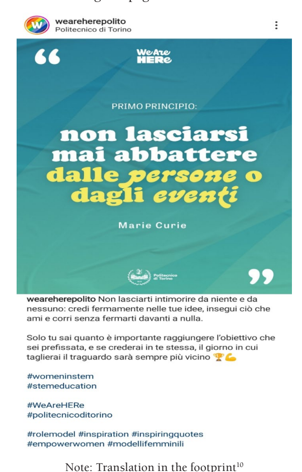
Figure 12. Picture with a quote from Marie Curie posted by WeAreHERe 's Instagram page on 15/02/2022