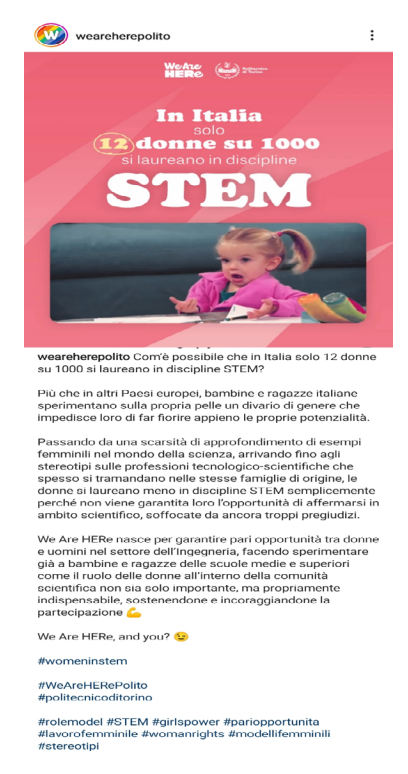
Figure 10. Meme with informational content published on the WeAreHERe's Instagram page on 08/02/2022.

Note: Translation in the footprint<sup>8</sup>