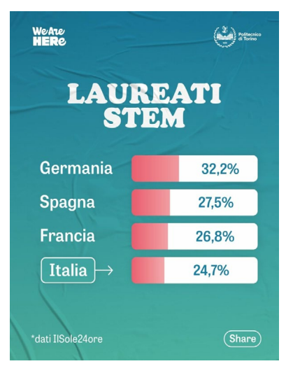
Figure 9. Picture posted by the Instagram page WeAreHERe.posted on 11/01/2022

Note: Translation to the textual post accompanying the picture in the footprint<sup>7</sup>