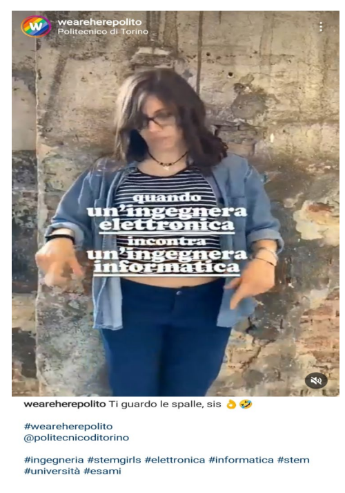
Figure 8. Thumbnail for a meme video posted by the WeAreHERe's Instagram page on 14/07/2022

Note: Translation in the footprint<sup>6</sup>