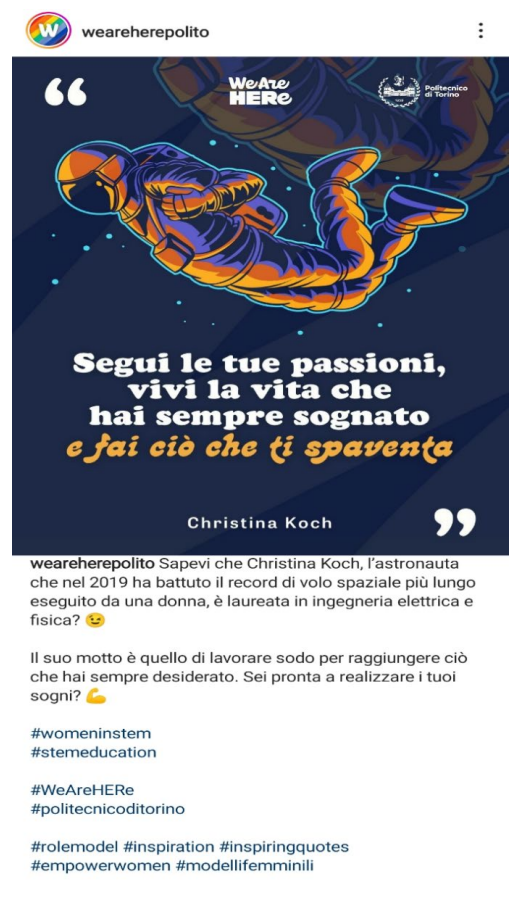
Figure 11. Drawing of an astronaut with a quote from Christina Koch posted by WeAreHERe 's Instagram page on 18/03/2022