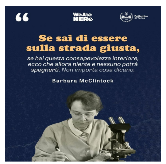
Figure 5. Picture of Barbara McClintock with one of her quotes, posted by the Instagram page of WeAreHERe on 02/08/2022

Note: Translation in the footprint<sup>3</sup>