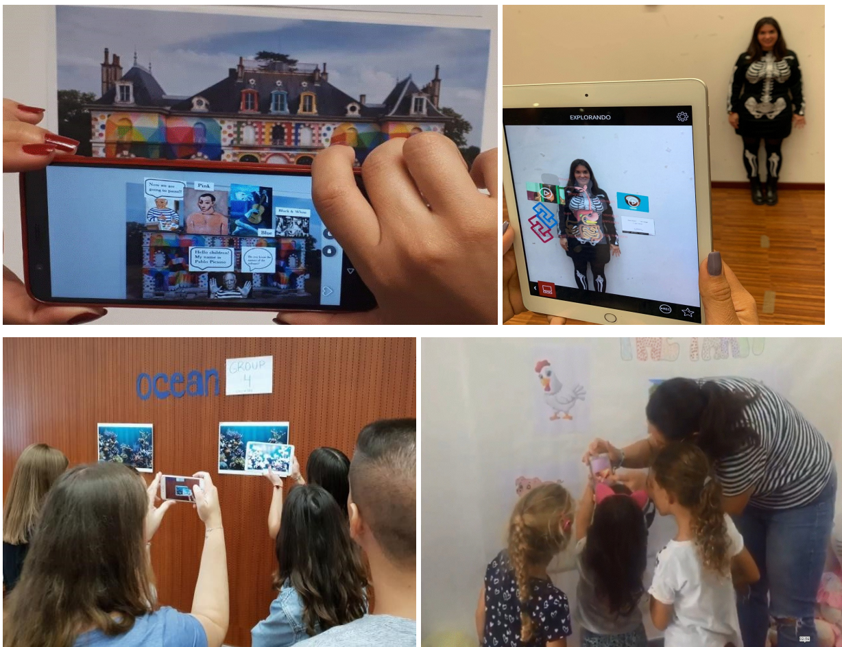
Figure 4. AR projects. From top left to bottom right: Art and museums (poster), The Digestive System (costume), AR project presentations (Ocean poster), AR project implementation with children (Farm animals mural).

The AR projects developed by the teacher candidates used three types of trigger elements, which needed to be closely related with the main topic of their English lesson: posters or murals, costumes and real-world objects, as illustrated in Figure 4.