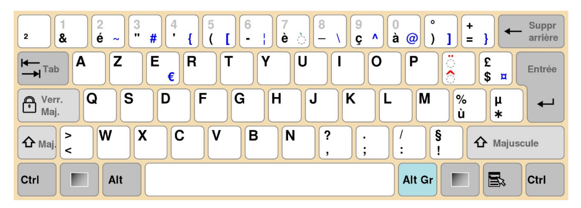
Fig. 2 – AZERTY (France) Keyboard layout<sup>13</sup>. Dead keys appear in red color and characters obtained by pressing "Alt Gr" simultaneously appear in blue and the sole case of both "" (dead key + "Alt Gr") appears in green.

- France and Belgium, that created a different standard called "AZERTY" during the last decade of the 19th century as a variation of QWERTY typewriters.<sup>12</sup> This variation pretends to make easier the typing in French Language by placing the numbers 0 to 9 in the "Caps" position of the top row to make easier the typing of accented vowels and lowercase "ç" and by switching letters "A" and "Q", by switching letters "W" and "Z" and by placing "M" letter right to "L", according to this layout: