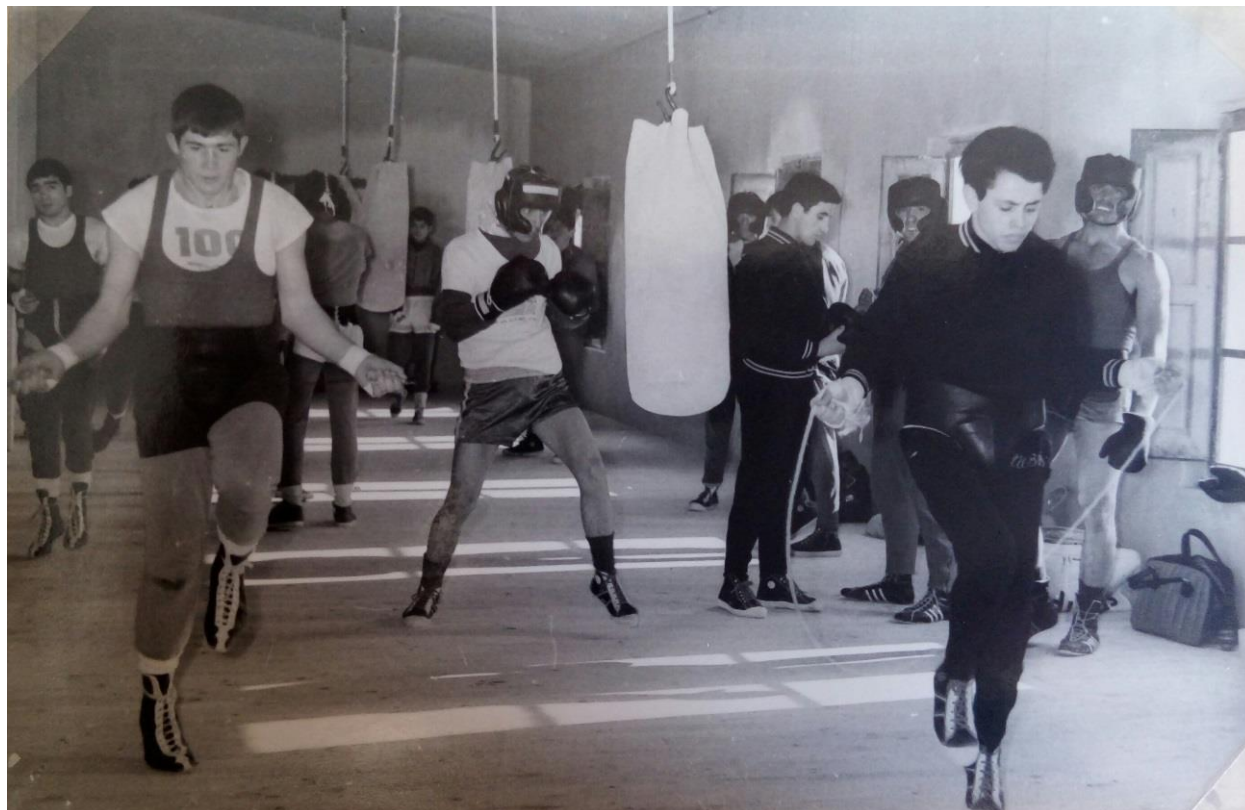
Figure 2. Boxers of the National Team in one of the training sessions before the celebration of the Olympic Games in Mexico in 1968.