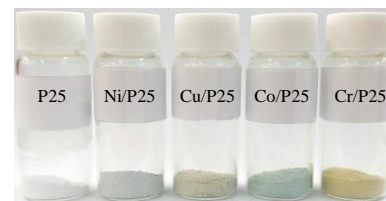
Figure 1. P25 and M/P25 samples.

The characterization of the photocatalysts shows that most properties of all M/TiO 2 catalysts are similar to those of P25: BET surface areas around 60 m 2 /g, about 88% crystalline phase (76% anatase and 12% rutile) and anatase crystallite size around 19 nm. However, they have quite different colour, which can lead to differences in optical and, hence, photocatalytic performance (Figure 1).