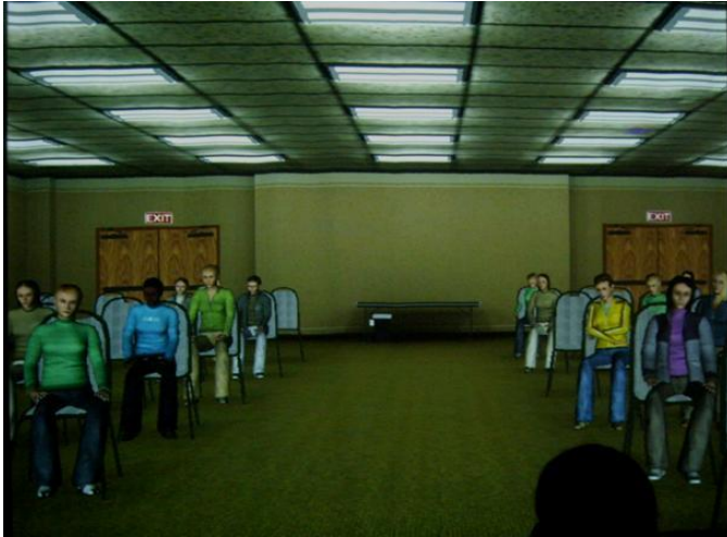
Figure 1. Virtual audience displayed during the speech