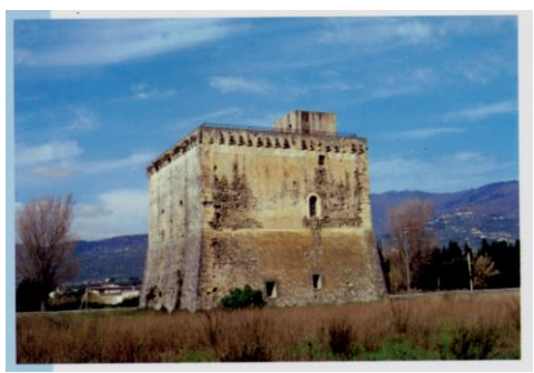
Fig. 2- Sant'Eufemia, near Lamezia Terme (Calabria), Bastion of the Knights of Malta,, Photographic Archive, ES-Progetti e Sistemi srl, Roma).

The fortified building was restructured in the middle of the XVIIIth century by order of the Knight Commander Fabrizio Francone, and confiscated because of the suppression of feudalism in the Napoleonic era in August 1806.