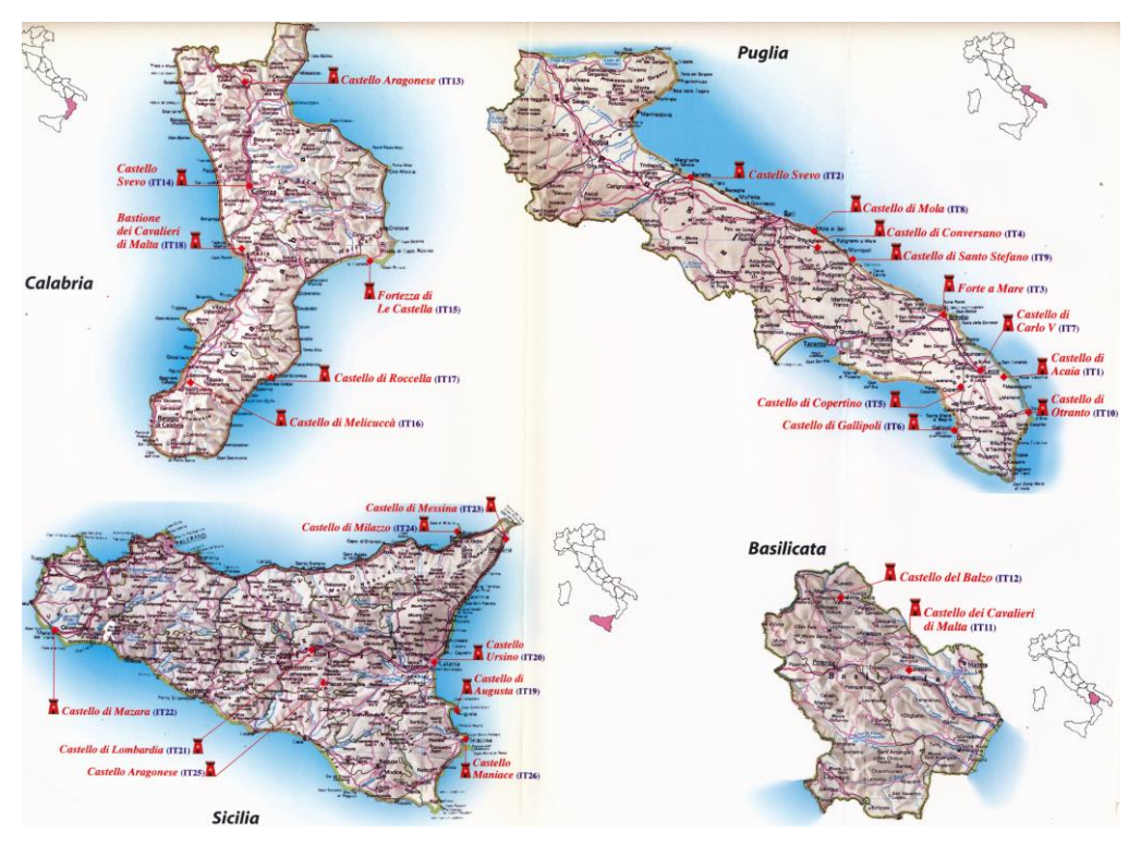
Fig. 1- Programma ARCHIMED. "Mapping of historical migration and preservation of their traces within the Mediterranean area". A thematic map of coastal Hierosolomytan fortifications in some regions of southern Italy, ES-Progetti e Sistemi srl, 2001.

The three examples are significant for the history of stratifications and new functions determined by the reuse that takes place mainly in the nineteenth century. They are also the only testimonies of castles or fortifications that bear the name belonging to the Jerusalemite order.