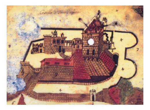
Fig. 3 Anonimus, Castello di Santo Stefano , first half of XVIIIth century. Naples, Archivio di Stato.