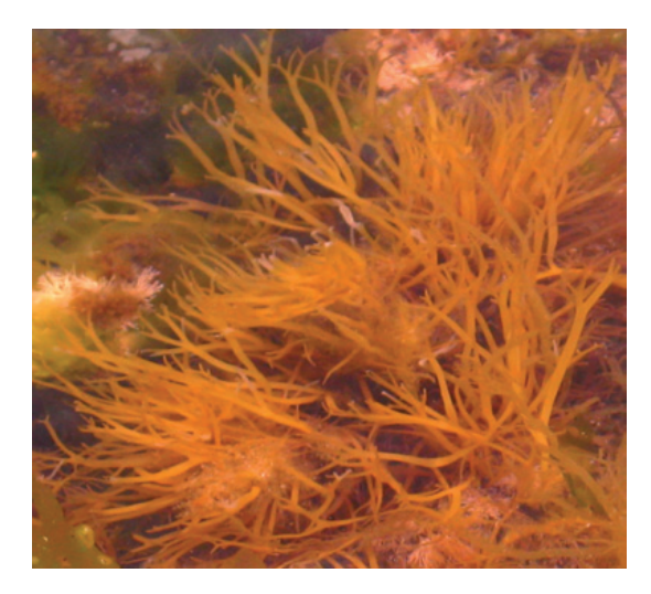
Fig. 14: Sarconema filiforme, Beirut, June 2010.

Described from Western Australia, this species of the Red Sea and the Indian Ocean was first found in the Mediterranean Sea in 1944 in Egypt (Aleem, 1948, as Sarconema furcellatum ). Subsequently, it was recorded from the South Levantine coast (Rayss, 1963, as S. filiforme f. gracillima ; Einav, 2007, misidentified as Solieria filiformis ) and from Syria, in lower sciaphilic infralittoral assemblages (Mayhoub, 1976).