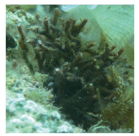
Fig. 7: Galaxaura rugosa, Batroun, May 2008.

In Lebanon, G. rugosa was first found in May 1995 at Kfar Abida, at 7 m depth, before to become invasive