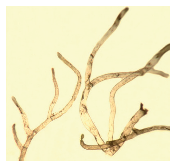
Fig. 22: Cladophora herpestica, Tyre, May 2016.