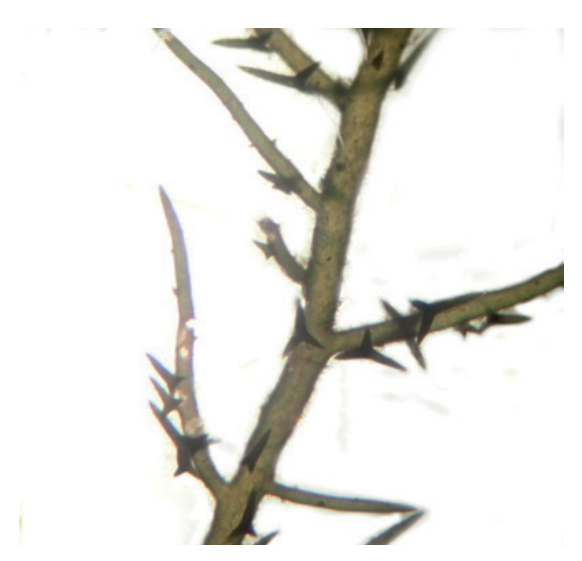
Fig. 9: Hypnea cornuta, Tyre, May 2016.