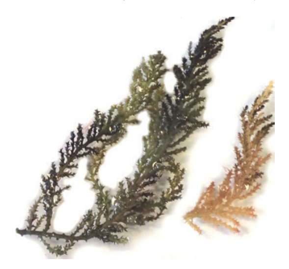
Fig. 5: Acanthophora nayadiformis, Tyre, May 2016.

In Lebanon, we first found A. nayadiformis in November 1991 at Tabarja (Bitar, 2010b). Currently, the