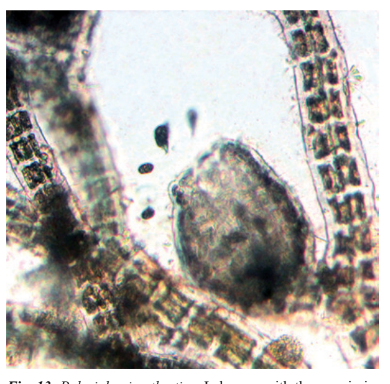
Fig. 13: Polysiphonia atlantica, Lebanon