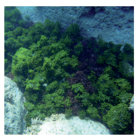
Fig. 25: Codium parvulum, Kfar Abida, August 2012.

In Lebanon, we first found C. parvulum at Nakour-