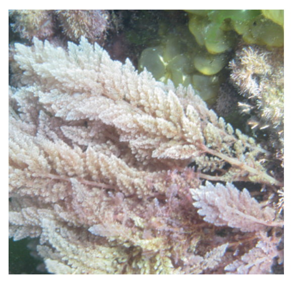
Fig. 6: Asparagopsis taxiformis, Beirut, April 2008.

In Lebanon, the tetrasporophytic phase described as 'Falkenbergia hillenbrandii' was first found in 1973 at Selaata, Barbara, Zouk Mkayel and Khalde (Basson et al., 1976), while gametophytes were only found in 1993 at Barbara and Batroun, near the sea-surface (Bitar etal., 2000). The species is common but not invasive on the whole Lebanese coast, down to 5 m depth (Lakkis & Novel-Lakkis, 2000, 2001; present study). Records of Asparagopsis armata / Falkenbergia rufolanosa from Batroun, El Manara, Tyre, Barbara and Beirut (Military Club) in 2014 (Kanaan et al., 2015) are probably misidentifications of A. taxiformis / F. hillenbrandii. Molecular studies showed that the species occurring in Lebanon belongs to the taxon distributed in the Atlantic Ocean and the eastern Mediterranean basin (Andreakis et al., 2007), so its alien status in the Mediterranean Sea requires confirmation (Cryptogenic taxon).