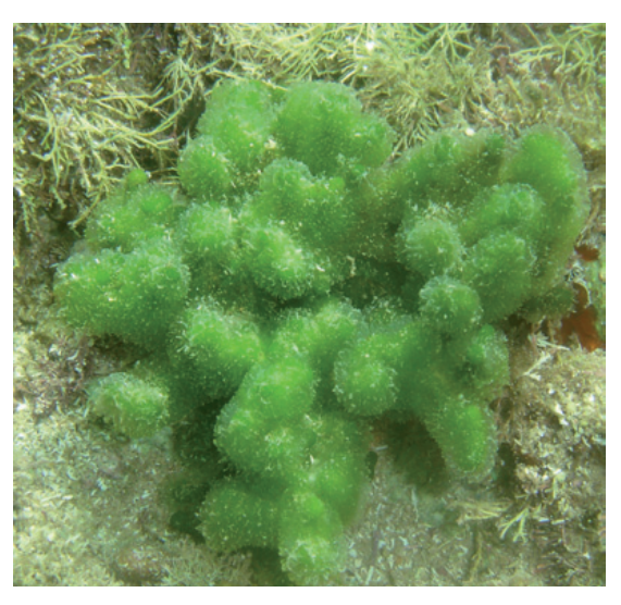
Fig. 24: Codium arabicum, Enfeh, June 2012.

In Lebanon, we found some individuals of C. arabicum at Hannouch in August 2007. Subsequently, we found it on a cliff, between 1 and 4 m depth, at Ramkine