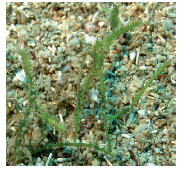
Fig. 21: Caulerpa taxifolia var. distichophylla, El Madfoun, October 2016.

In Lebanon, C. taxifolia var. distichophylla was first found in October 2016 at El Madfoun and Byblos, between 16 and 48 m depth, where it constituted small patches (10-40 cm in diameter) on sand and gravels. Lebanese specimens were well characterized by (i) the thallus tiny with fronds, up to 3.5 mm broad and 10 cm high, bearing distichously arranged pinnules, and (ii) the pinnules closely adjacent, compressed, slightly upwardly curved, broadest just above the base, and tapering to a distinct spinous tip. Caulerpa taxifolia var. distichophylla , which is invasive in the Central Mediterranean basin (Sicily; Jongma et al. , 2013), is recorded for the first time from Lebanon.