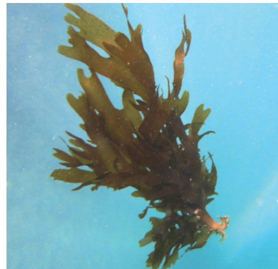
Fig. 3: Spatoglossum variabile, Raoucheh, June 2015.

In Lebanon, S. variabile was first found in July 2009 at Tabarja. Subsequently, it was observed in June 2010 at Enfeh, and in June 2015 at Beirut and Raoucheh, where it constituted a subtidal belt close to the sea-surface. Lebanese specimens were well characterized by (i) the thallus complanate and subdichotomously to irregularly