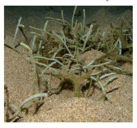
Fig. 19: Caulerpa racemosa var. lamourouxii f. requienii, Batroun, September 2016.

Described from the Red Sea, this species was first foundin the Mediterranean Sea in 1951 along the South