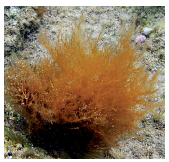
Fig. 10: Hypnea valentiae, Lebanon, with the permission of Prof. Oksana Belous.

Since its description from the Red Sea, H. valentiae has been reported worldwide in warm seas and in the Mediterranean Sea. However the first illustrated Mediterranean record dates only from 1996 in France (Verlaque et al. , 2015). In the eastern Mediterranean basin, it was first collected in the south-eastern Aegean Sea at Rodos Island, Greece (Tsiamis & Verlaque, 2011).