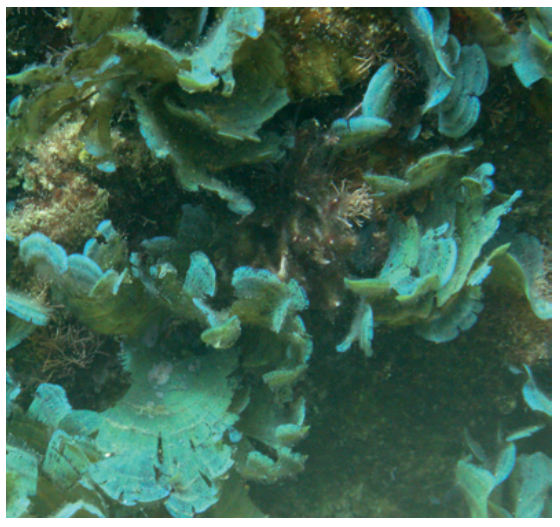
Fig. 4: Stypopodium schimperi, Nakoura, March 2008.

Described from the Red Sea, this species was probably first observed in the Mediterranean Sea in Syria in 1979 [Mayhoub, 1989, as Stypopodium fuliginosum (Martius) Kützing; Mayhoub & Billard, 1991, as S. zon-