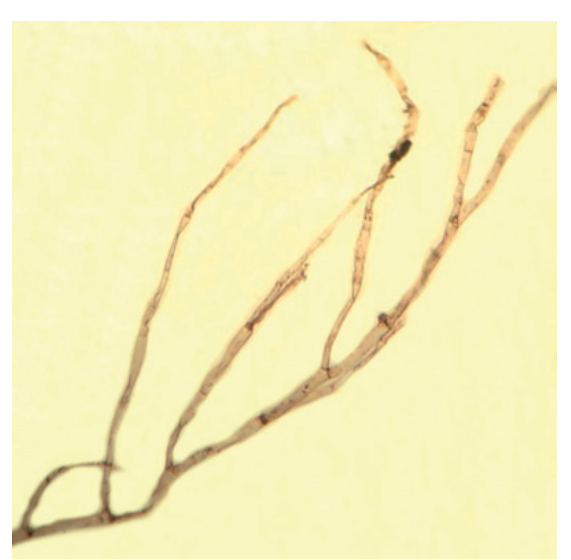
Fig. 23: Cladophora patentiramea, Tyre, May 2016.