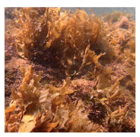
Fig. 2: Padina boergesenii, Tyre, August 2013.

The Padina sp. observed in August 2010 at Ramkine Island, between 4 and 5 m depth (Bitar, 2010b), might be either P. boergesenii or P. tetrastromatica Hauck, another Indo-Pacific species discovered in Syria (Mayhoub, 2004), and is not yet reported from Lebanon. Padina boergesenii is well established along the Levantine coasts.