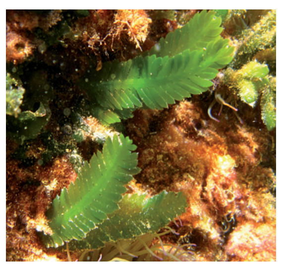
Fig. 18: Caulerpa mexicana, Beirut, July 2016.

In Lebanon, we found an individual of C. mexicana in 1991 off the Riviera Hotel at El Manara (Beirut), on