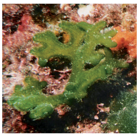
Fig. 26: Codium taylorii, Hannouch, August 2012.

In Lebanon, we first found C. taylorii in September 2002 at Ouzai, on the breakwater close to Beirut Airport (Abboud-Abi Saab et al. , 2003; Bitar et al. , 2007, Bitar, 2010b). Currently, C. taylorii is well established along the whole Lebanese coast, without being invasive.