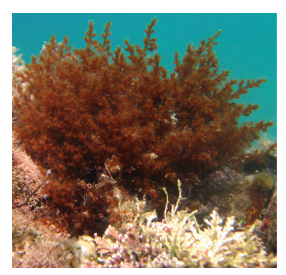
Fig. 11: Laurencia cf. chondrioides, Saadiyat, April 2013.

Both its recent arrival and its invasive behaviour argue in favour of an introduction on the Levantine coasts. However, the natural presence of L. chondrioides in the Canary Islands, where many Mediterranean taxa are native, makes a recent introduction of the species into the Mediterranean Sea unlikely (Boisset et al. , 1998). Consequently, the origin and the identity of this invasive Laurencia should be confirmed by molecular study because the possibility of an introduction through the Suez Canal of another Indo-Pacific species must be considered.