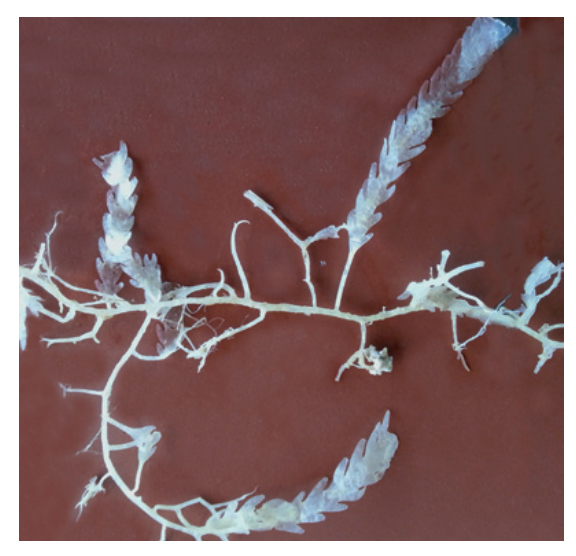
Fig. 20: Caulerpa scalpelliformis, Ras Chekaa, June 2012.