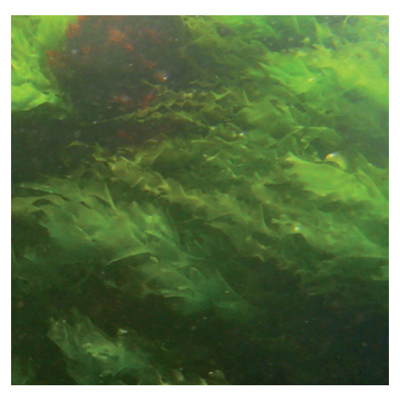
Fig. 27: Ulva lactuca, Beirut, June 2010.

All the European records of U. lactuca over the past 200 years correspond to another species referable as ' U. lactuca auctores' (Verlaque et al. , 2015). The genuine U. lactuca is an alga widespread in warm seas and usually known as U. fasciata Delile (1813), a taxon described from the Mediterranean Sea (Egypt, Alexandria), before the opening of the Suez Canal. However, the chronology of Mediterranean records suggests multiple introductions via different vectors or co-occurrence of introduced and native populations (Verlaque et al. , 2015). Ulva lactuca was recorded along the whole Levantine coast (Mayhoub, 1976; Hoffman, 2014a; both as U. fasciata ).