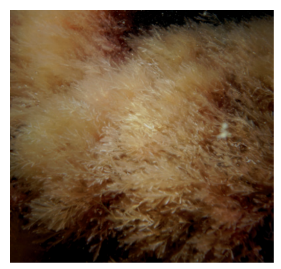
Fig. 12: Lophocladia lallemandii, Lebanon, August 2015.