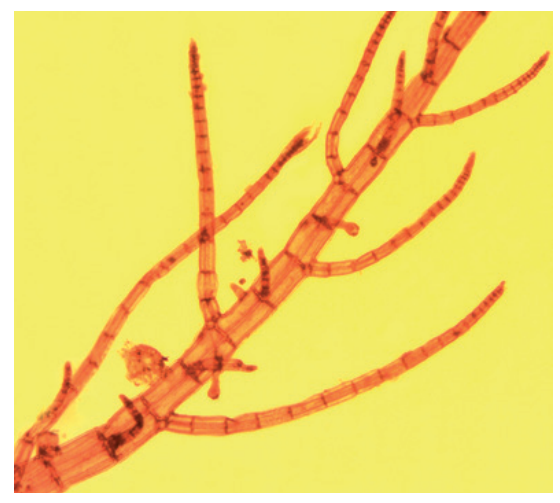
Fig. 15: Womersleyella setacea, Batroun, October 2016.

Described from Hawaii and widespread in the Tropical Pacific and Atlantic Oceans, this species was first