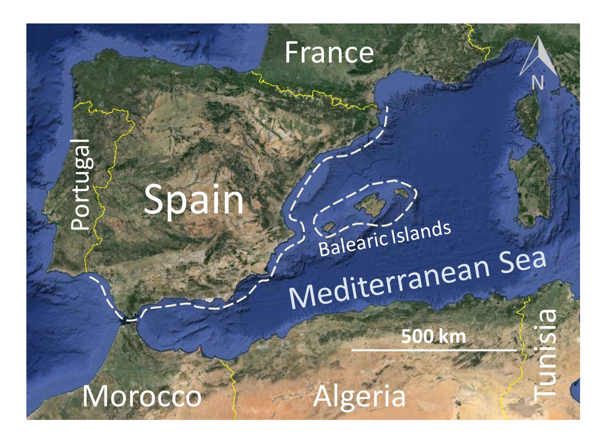
Figure 1. Study area along the Spanish Mediterranean coast (dashed line).