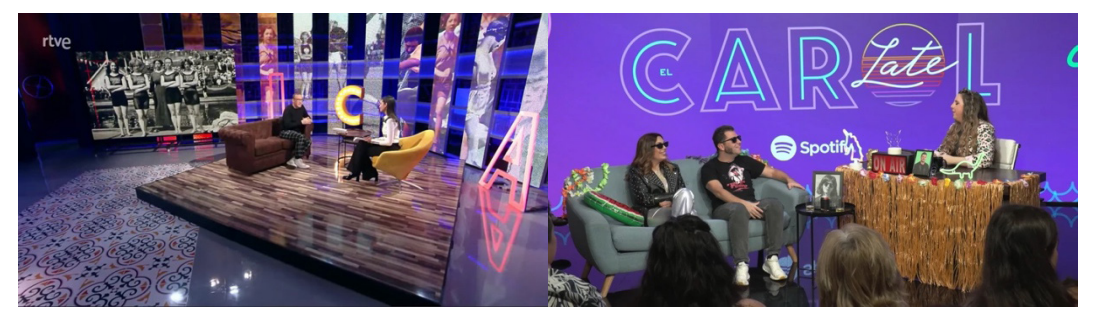
Figure 3. Images of the production plans of Culturas 2 and CaroLate

In terms of staging, 39% are corporate and almost 22% are with an audience. This shows that staging is done by recording in professional studios or in theatres and venues where listeners are present at the live shows of the most successful podcasts, such as those previously mentioned. The studio audience is more typical of the podcasts that are recorded in collaboration with Podium Studios, such as El CaroLate . Furthermore, podcast editing is much more carefully done in Spotify Studios<sup>1</sup> own production podcasts in alliance with Podium Studios, such as the aforementioned, El CaroLate , El Aura , with Alba Reche, Dulces y Saladas from Prime Video and Nadie Sabe Nada, which are also designed for broadcasting on the platforms, or those by RTVE's Playz, such as Culturas 2 , El año de las emociones , Gen Playz and La cámara de Gesell , in which the use of professional production, technical and human resources can be appreciated. In these cases, the editing is faithful to that of any other television format, with the insertion of videos, the use of more than two cameras and the introduction of graphics. In the same way, the sound is appreciated to a greater extent when the sound production companies are behind the creation of these video podcasts, in which multi-camera production is also encouraged, although not with the mastery of the audiovisual production companies that work for RTVE or Prime.