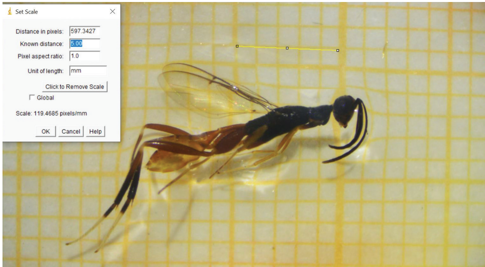
Figure 2. Measurement of FW: fore wing, using millimeter sheet.

lies, representing altogether 40% of the whole sample (Table 1). The Jackknife 1 richness estimator predicted 34 families, using six Malaise traps for nine weeks; so, we collected 93% of the expected families for this method in the low deciduous forest of Yabucu (Table 2).