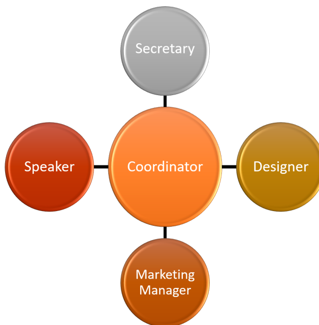
Figure 2. Overview of the roles played in the activity proposed.

The coordinator is the spokesperson in the group. Coordinators assign the roles to the rest of the members of the team and have direct communication with the instructor. The role of the coordinator is the only one voluntarily chosen by the students. They can also select one student to be in their team. The rest of the students are randomly distributed among the teams created. The other roles are defined as follows: